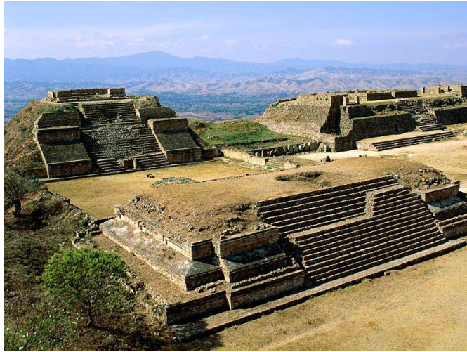
These impressive ruins were home to Mixtec and Zapotec rituals for centuries before falling to the Spanish in the 16 th Century

After breakfast meet your guide at the hotel lobby for a privately guided full day excursion to the mysterious ruins of Monte Alban and Mitla. Spend a few hours hiking and exploring these magnificent Zapotec sites and enjoy a traditional lunch in a local restaurant.