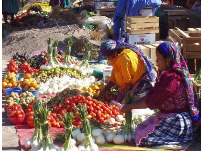
Oaxaca is home to over 17 unique indigenous groups, each adding to the cultural richness of this UNESCO world heritage site

Please note that this proposed itinerary is subject to availability.