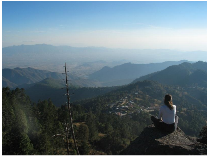
The pine clad Sierra Norte is home to the decedents of Zapotec Kings. Their traditions live on in their daily lives.