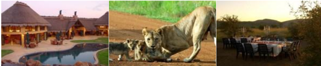
Ivory Tree Game Lodge

On arrival in Johannesburg, please proceed to the Arrivals Hall. Your Hills of Africa Travel guide will meet and transfer you to Pilanesberg National Park (approximately 2.5 hours).